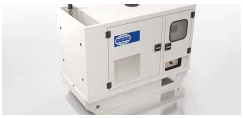
The metal enclosure is manufactured from high grade steel, protected by powder coat paint, to provide a durable, sturdy enclosure.