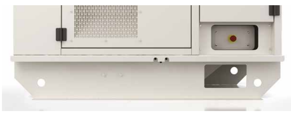
The baseframe featuring drag points for ease of installation and handling, extends beyond the enclosure, further protecting against damage during transportation and installation.