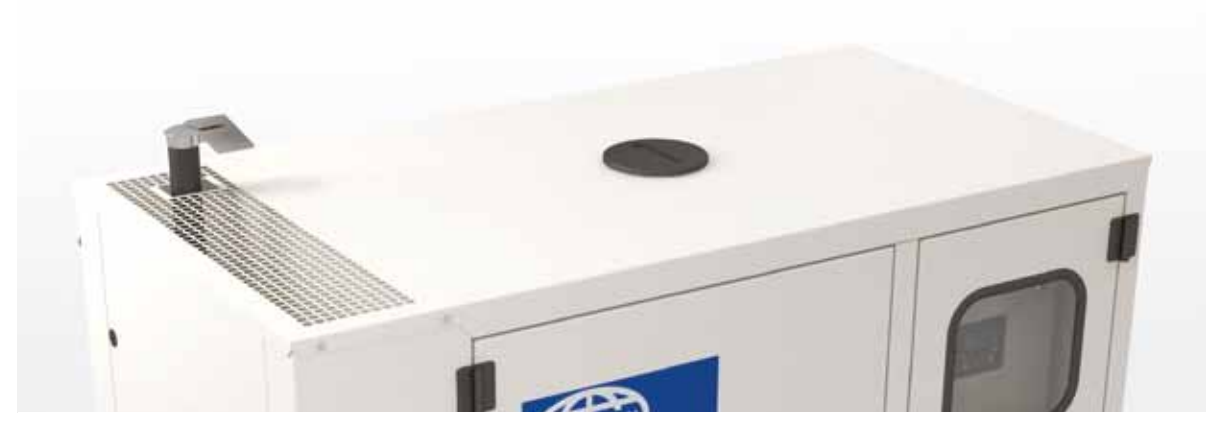
The robust single piece roof incorporates a flush mounted access cap with compression seal, allowing access to the single point lift, whilst providing excellent protection against water ingress. The exhaust silencing system is housed inside the enclosure, delivering market leading noise levels while ensuring operator safety.

Our metal enclosure option, proven in the marketplace for many years, has been further enhanced to continue to provide the best service and maintenance access possible, whilst maintaining its original design.